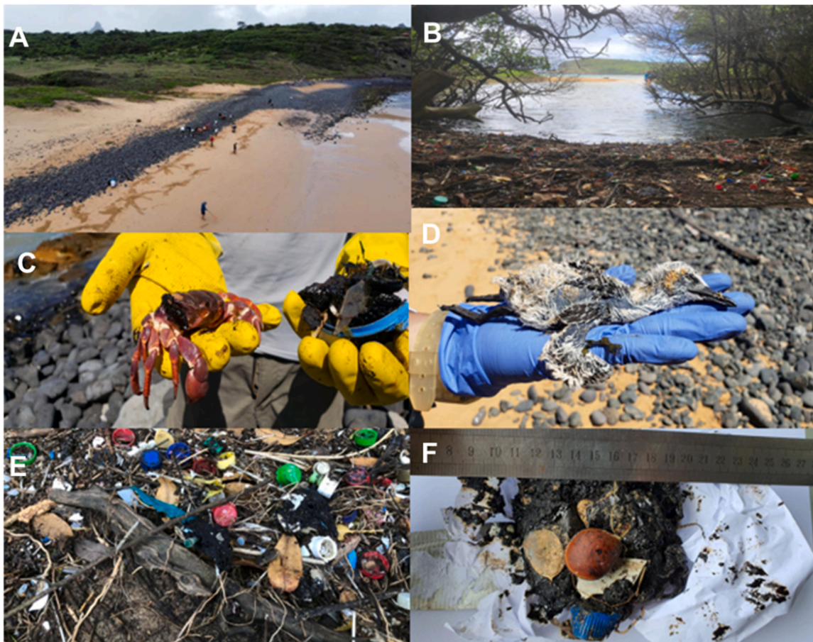
Fig. 2. Debris and oil collection in the Fernando de Noronha Archipelago (South Atlantic, Brazil). A) Collection effort at Leão beach, the most affected area; b) Insular mangrove at Sueste bay with debris deposition; c) Fauna (crustacean Johnnarthia lagostoma ) affected by the oil stains at Abreu's beach; d) Bird affected by the debris and oil; e) Aspect of the debris deposited in the mangrove; f) Oil sample containing mangrove seeds from plants ( Dioclea sp.) not established in the South Atlantic archipelago.