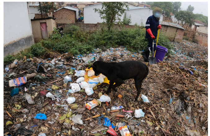
Fig. 1. Stray dog rummaging through disposable diaper waste on an open dump site in Ndirande, Blantyre, Malawi.

To date, there has been minimal research into understanding the trends in, and challenges behind, the use of disposable diapers in LMICs. Given the increasing global usage of disposable diapers and their potential to act as a reservoir for pathogenic microorganisms, there is a pressing need to raise awareness of the problems associated with diapers in the environment. Here, we critically discuss the challenges associated with the use of disposable diapers in LMICs, drawing particular attention to common disposal practices employed by caregivers, and the resultant impacts on environmental and human health.