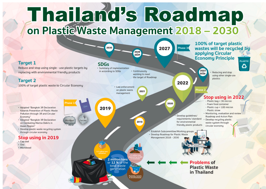
Fig. 1. Thailand's roadmap on plastic waste management 2018–2030.

with a view to achieving “zero plastic waste” by 2027. Despite these efforts, Thailand has consistently failed to achieve its annual targets and was ranked the lowest among several countries in a 2022 survey by the Organisation for Economic Cooperation and Development (OECD) for its non-compliance with key policy instruments aimed at strengthening EPR (extended producer responsibility) and improving recycling rates by imposing landfill taxes (Fig. 2) (OECD, 2022). At the same time, the results of Fig. 2 can be understood through our lens of inequality/inequity. Thailand, as a waste-importing country, processes plastic products from several developed countries, compromising its capacity to develop sustainability measures at a corresponding pace. Compounding this burden, within Thailand, the political power wielded by petrochemical companies aggravates domestic inequalities and impedes the ability of government agencies to act cohesively in implementing meaningful environmental reforms.